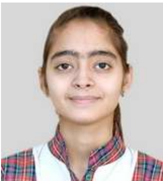
SHATAKSHI (94.8%) 3-A1, 2-A2 ECO: 98, MUSIC: 99