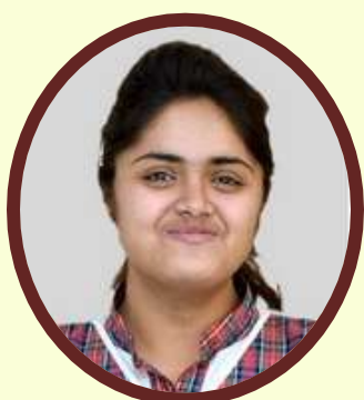
JANVI (97%) Commerce

QPI (Average Score) of the school- 84.46